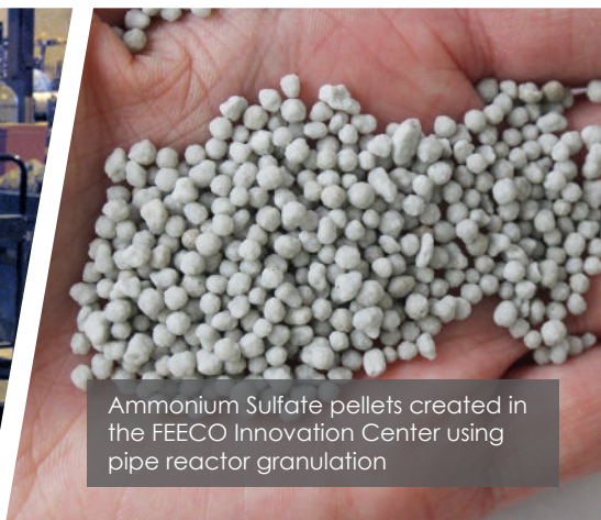
Ammonium Sulfate pellets created in the FEECO Innovation Center using pipe reactor granulation