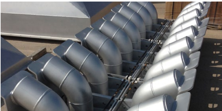
Ball and tube knockers ready for mounting