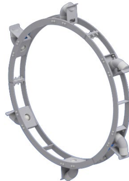
From top to bottom: Drawing and 3D rendering of ball and tube knocker; 3D rendering of ball and tube knockers on mounting bands.