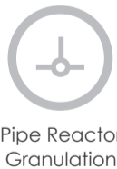
Pipe Reactor Granulation