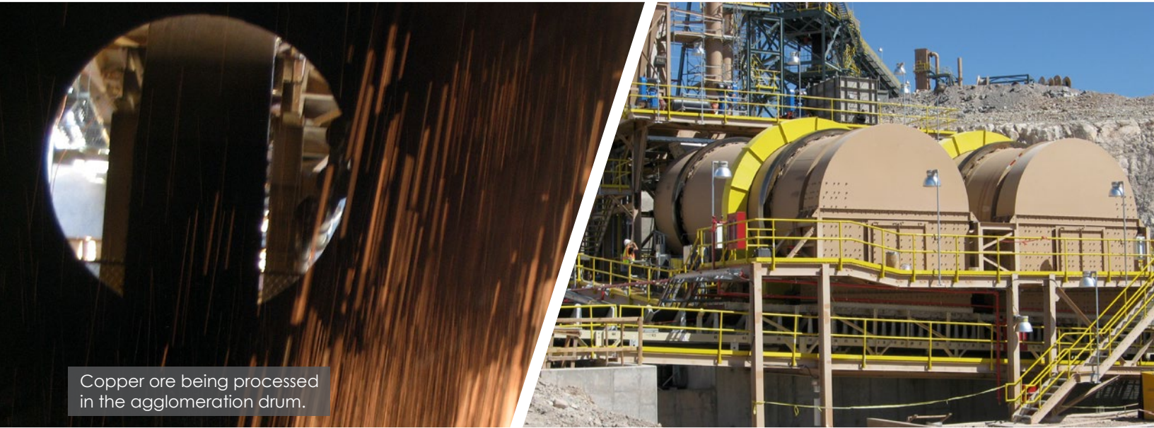
Copper ore being processed in the agglomeration drum.