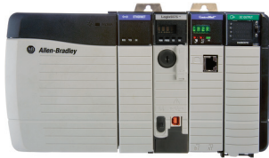
Allen-Bradley ControlLogix Programmable Automation Controller