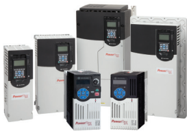
Allen-Bradley PowerFlex AC Drives

Innovation drives the success of most businesses. And that's especially the case for heavy industries where accelerating environmental concerns and regulatory requirements are having a significant impact.