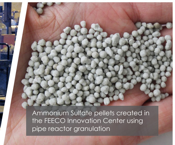
Ammonium Sulfate pellets created in the FEECO Innovation Center using pipe reactor granulation