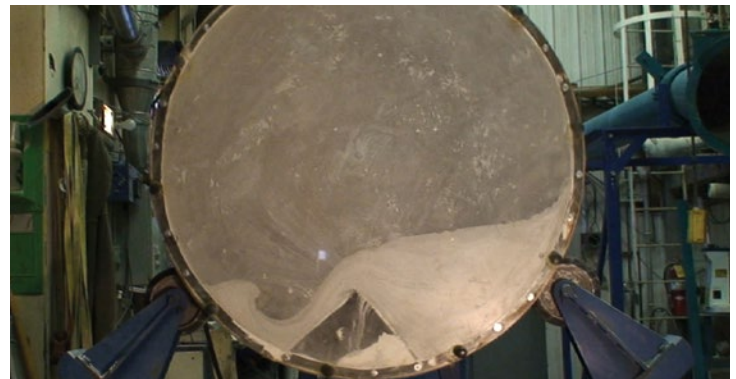
The image above shows the testing of a bed disturber (aka a mixing flight) with a talc material. The goal of the test was to determine how well the talc was being mixed as a result of the bed disturber. In a process setting, this would ensure uniform temperature throughout the bed.

Visual Analysis - To determine the impact of the selected variables on the material behavior; is the material showering or discharging in clumps; is