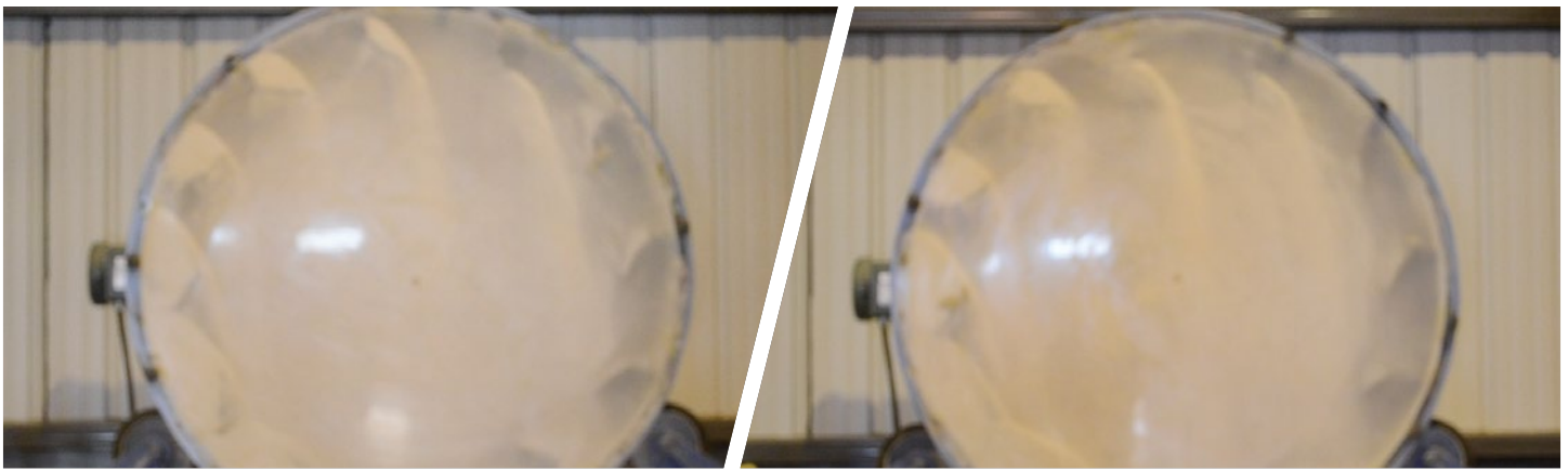
The pictures above show the same lifter configuration at two different rotational speeds. The picture on the left shows a good distribution of solids across the width of the unit. The gaps seen in the picture would be filled in by off-setting the lifters. In the picture on the right, the rotational speed is increased and the lifters empty later, giving a poorer distribution.

for visual observation throughout the testing process.