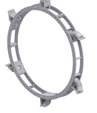
From top to bottom: Drawing and 3D rendering of ball and tube knocker; 3D rendering of ball and tube knockers on mounting bands.