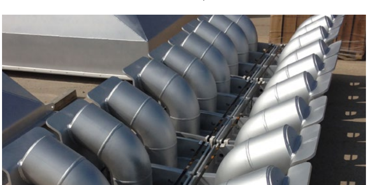
Ball and tube knockers ready for mounting